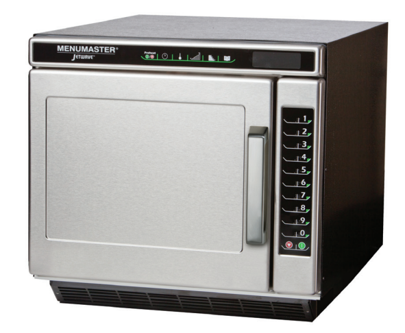
Model JET5192 shown